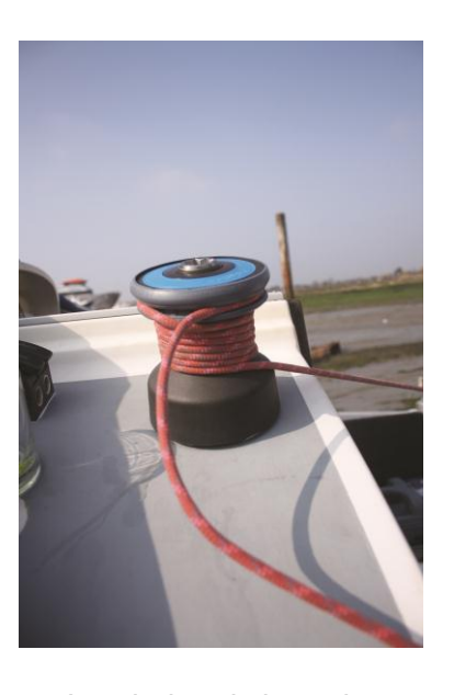
Loaded and cleated