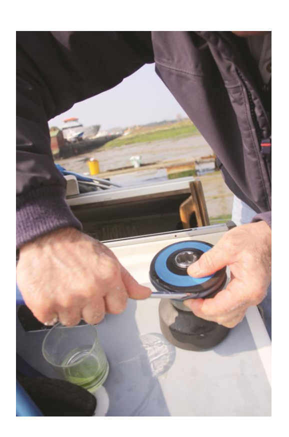
Step 3: Fitting Wincher lip to drum top lip