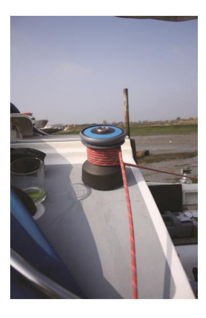
Loaded and self-tailing