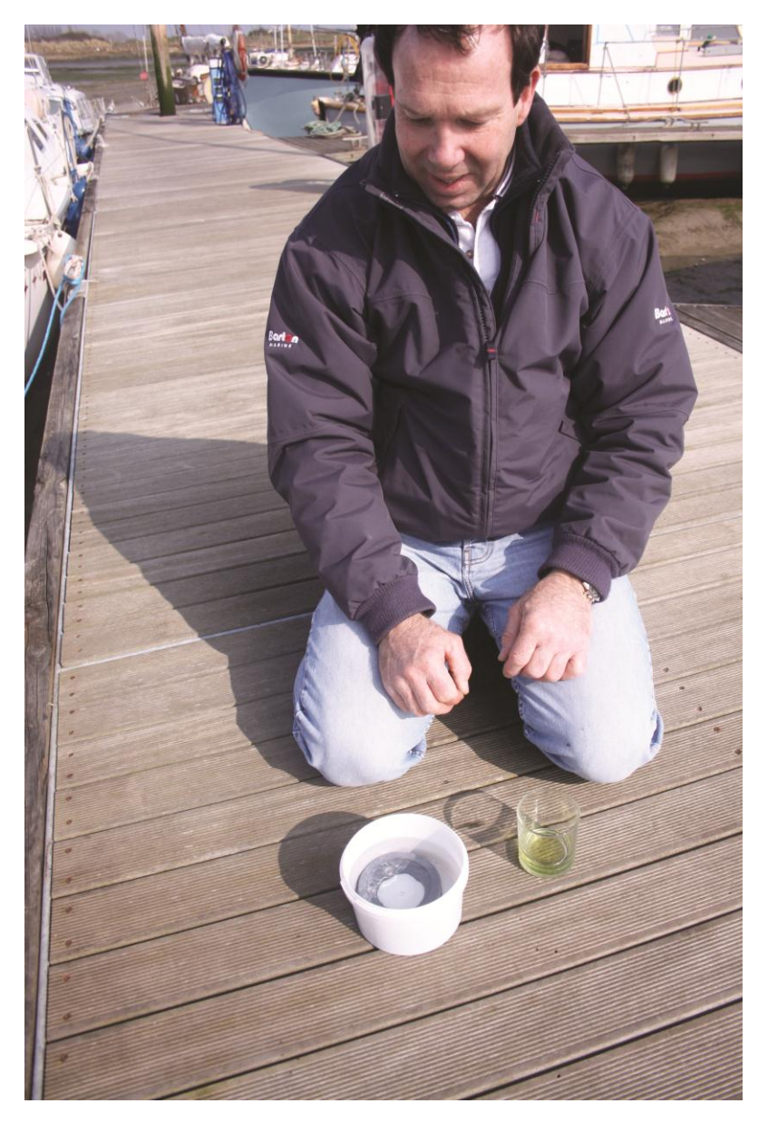
Step 1: Immersion

Step 1: Boil a kettle of water and fill the container with enough water to cover one Wincher. Let it cool a little, add some washing up liquid and immerse one wincher for a minimum of 5 minutes. It is not unusual for the Wincher to change colour from dark grey to light grey as it heats up.