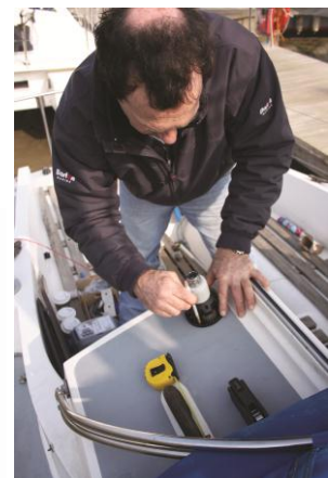
Marking bolt holes