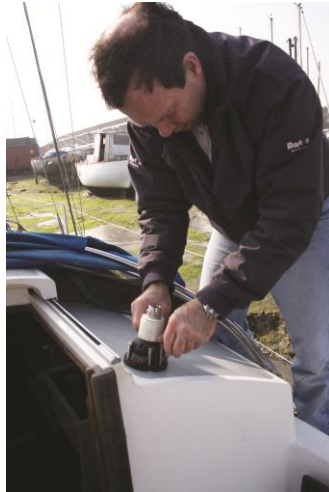
Offering up bolts